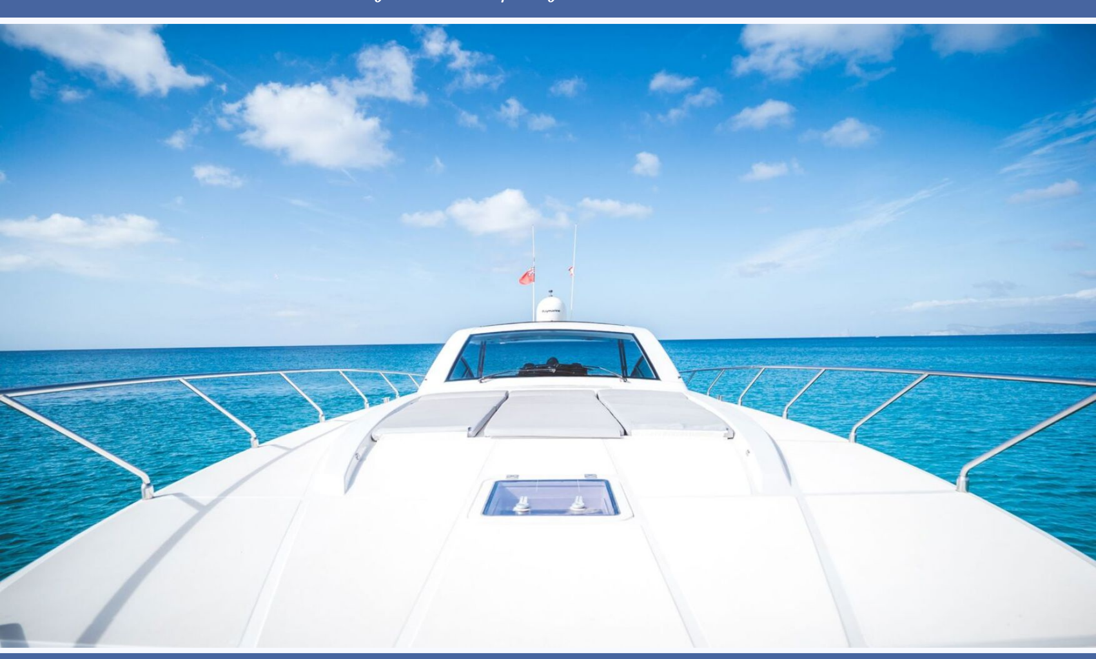
PRIAMOS - SANTA EULALIA 18m (59'), CAPACITY: 12 (day), 4 (sleeping)